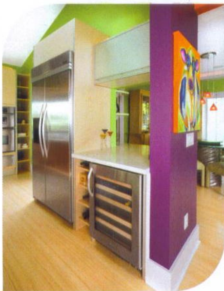
TOP RIGHT: Environmentally safe and odor-free paint in green, orange and purple tones brighten the main living space. TOP LEFT: Aluminum wall cabinets, with hinged doors, hold glassware. ABOVE: The floors, comprised of bamboo, are also environmentally safe.